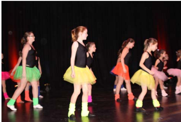
Girls from Years 4 - 6 Dancing to Brittany Spears 'Womanizer'

Saturday 28 February: Darlington Primary Schools Cross County Event. Our Team of 10 Cross Country runners, competed against other Primary schools from Darlington. They all trained extremely hard - well done!