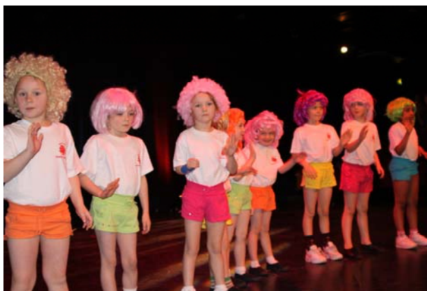
Girls from Years 1 - 3 Dancing to 'Carwash'

Thursday 12 February: Darlington Dance Festival. We took two teams of children to the Arts Centre to take part in this years Darlington Dance Festival. Children from across Darlington performed in the Festival. This included children from Primary and Secondary Schools and also Queen Elizabeth College. Our children worked very hard and we are very proud of them.